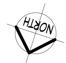
1 Ground Floor 1:100